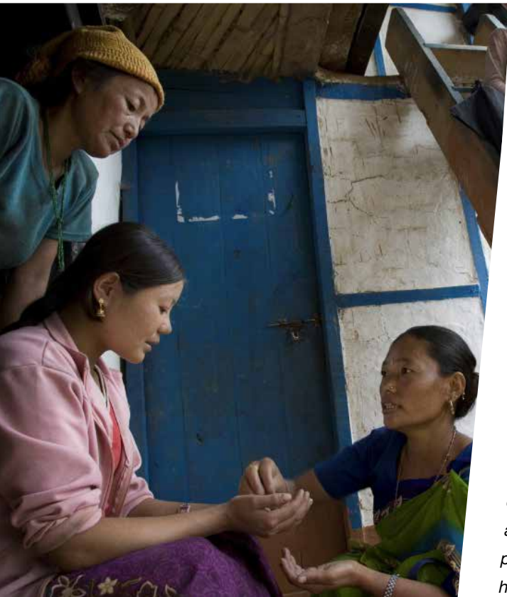
A community health volunteer in Nepal (right), provides Vitamin A, iron and folic acid supplements to a woman who is nine months pregnant, during a home visit in the remote mountainous Eastern Region.

From the outset, discussions about the post-2015 UN development agenda have recognized and emphasized the central importance of social inclusion in the new development framework. This Issue Brief aims to further enhance those ongoing discussions by demonstrating that volunteerism, when well facilitated, can be a powerful mechanism for promoting social inclusion throughout the world. With the support of research-based evidence, it demonstrates how the values inherent in volunteerism open up diverse pathways for marginalized groups to overcome social exclusion, while enabling them to become drivers of development action. Any framework that aims to reverse a ‘top-down’ approach must recognize the contributions of volunteerism in aiding progress towards the Millennium Development Goals and sustainable human development in a post-2015 world.